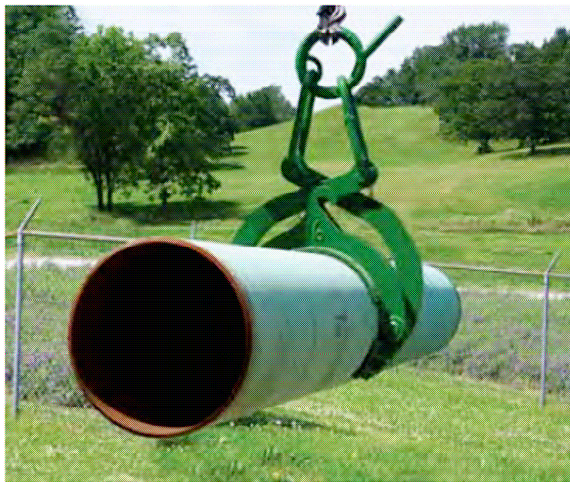
The Fiber Pad of the Automatic Pipe Tong allows the pipe to be firmly grasped, safely lifted and lowered into the trench.

The Pipe Tongs conveniently grasp the pipe to move it into the trench or about the pipe yard. The Lifting Ring closes the Clamp securely so that it can be safely moved. The pads of the Pipe Tong are made of rubber and cotton to avoid contamination of stainless and other specialty alloys. The Tongs are available for 2" to 36" / 51mm to 914mm steel, stainless steel and other specialty alloy pipes and fittings.